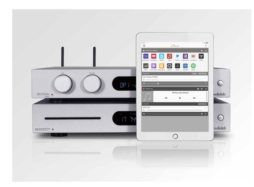
6000A Play pictured with the optional 6000CDT CD transport – also from Audiolab's 6000 Series – and a tablet running the Play-Fi app

Play-Fi supports a wide variety of file formats, including MP3, MP4A, AAC, FLAC, WAV and AIFF. In standard mode, which is optimised for multi-room bandwidth, audio is streamed at up to 16-bit/48kHz – akin to CD-quality. By engaging Play-Fi's Critical Listening Mode, hi-res audio up to 24-bit/192kHz may be streamed to the 6000A Play over Wi-Fi or Ethernet cable, without transcoding or down-sampling.